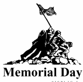
Memorial Day